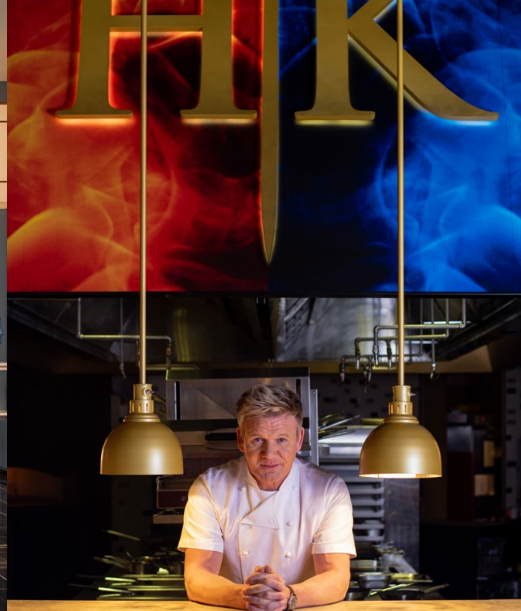
GORDON RAMSAY HELL'S KITCHEN CAESARS PALACE