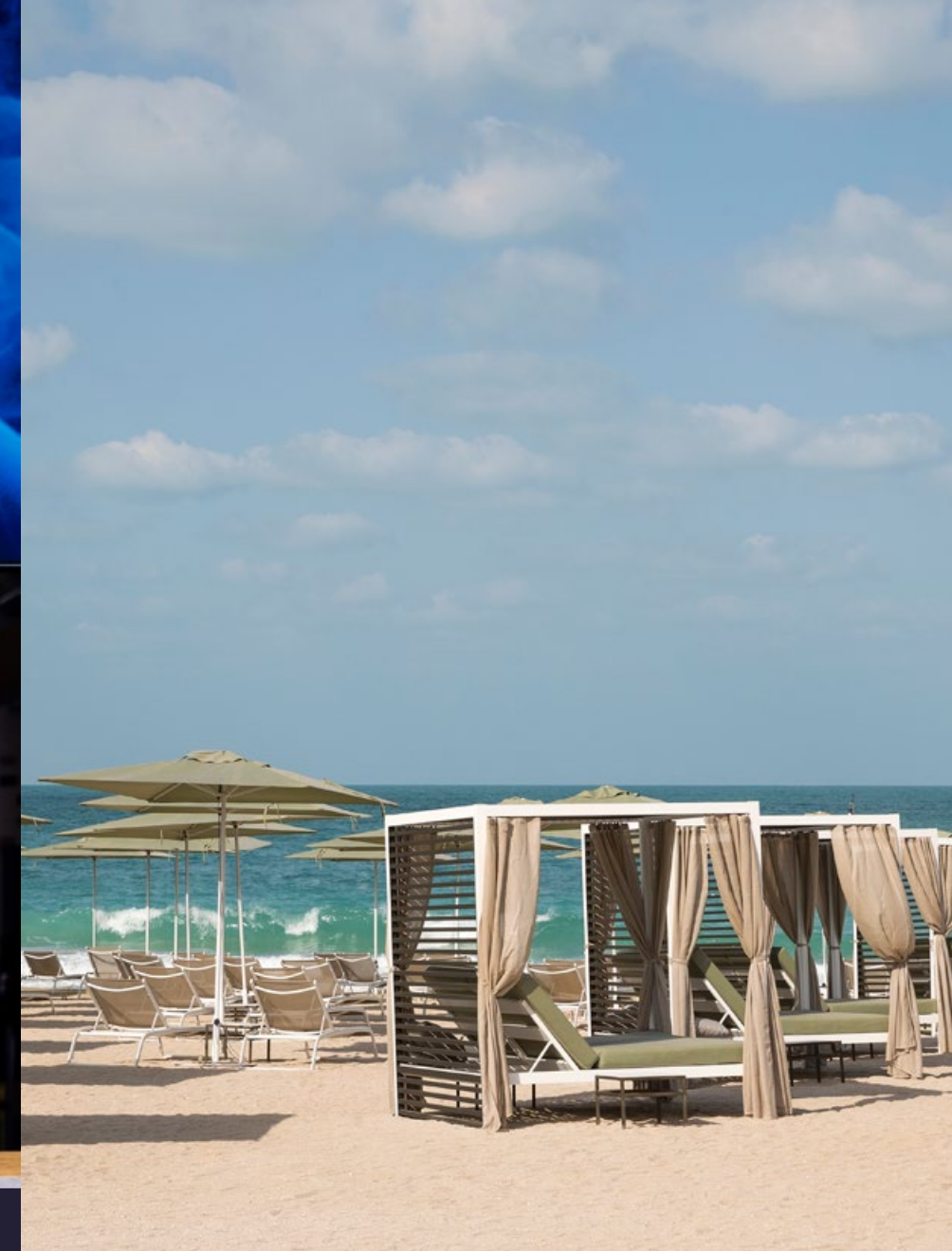
BEACH- CAESARS RESORT