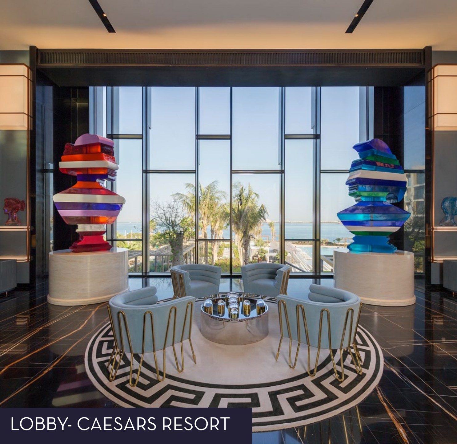
LOBBY- CAESARS RESORT