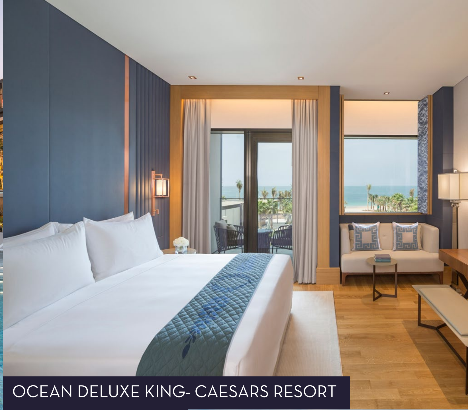
OCEAN DELUXE KING- CAESARS RESORT