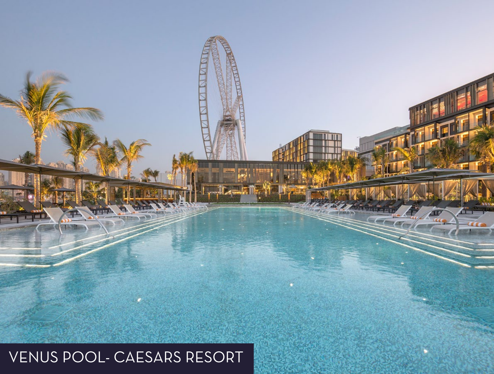
VENUS POOL- CAESARS RESORT